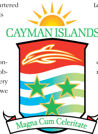
We redesigned the Cayman Crest to include the Latin phrase 'Magna Cum Celeritate' ('With Great Speed')

Everything from the renewal of a driver's license to clearing a package at customs to getting past the ridiculous number of redundant security checks at Owen Roberts International Airport has become an ordeal. Even worse, consider the plight of someone attempting something really complex—such as developing a condominium complex or putting a back porch on your